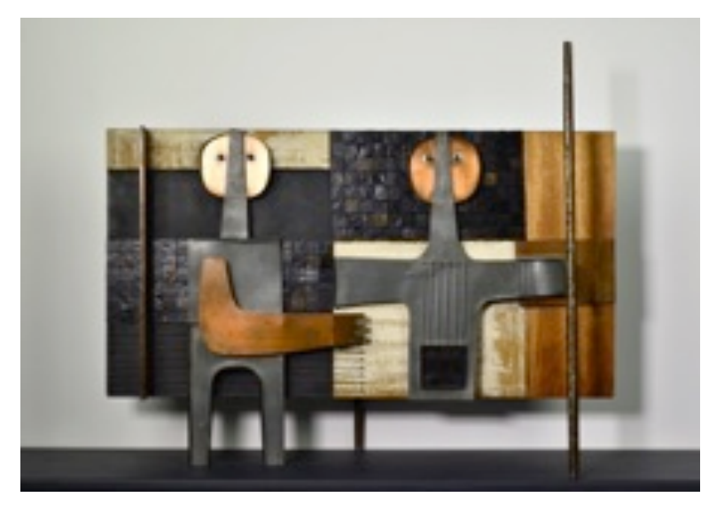
Pilgrims ...for we are strangers and pilgrims on earth seeking a heavenly homeland,

Henk Krijger, Illustrator of Life, a new exhibit at the Atrium Gallery showcasing forty-four selected works of narrative art by Dutch artist Henk Krijger, 1914 – 1969.